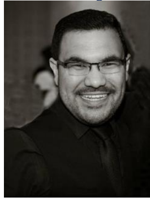
Homero Lopez Immigration Services and Legal Advocacy