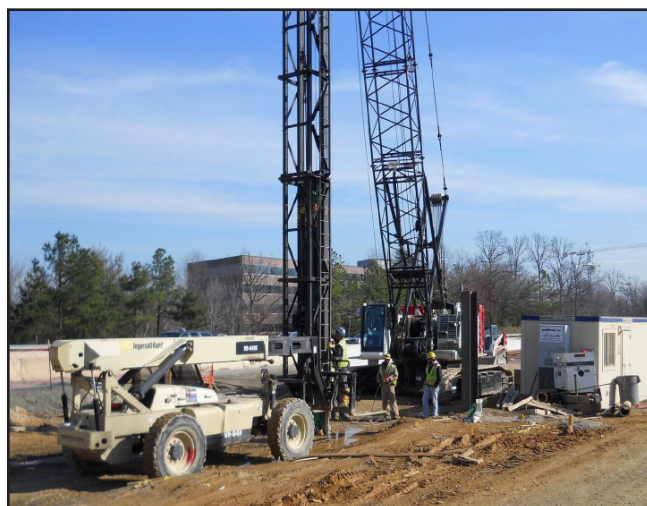
Tunnel underneath Route 123 and Route 7 is nearing completion with track work scheduled early 2014.

In 2006, Virginia reached an agreement with the Authority that addressed the building of this Metrorail exten-