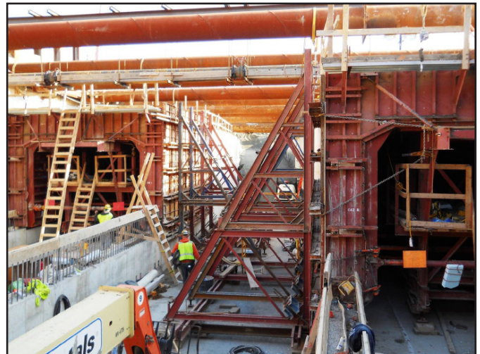
Dulles Corridor Metrorail Project crews have been working on tying in the new system with Metro's existing Orange Line.

finance for the Metrorail line extension that projected (i) the portion of the line's construction cost to be funded by the DTR, 2 (ii) the toll road revenue bonds to be issued over time to raise these construction funds, and (iii) the toll rates needed to produce annual revenues to meet both the debt service on these bonds and the toll road's operating costs.