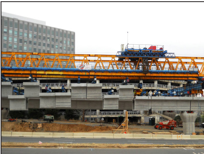
One of the two giant blue and yellow trusses is approaching the future Tysons West station causing overnight closures at Spring Hill Road through December. Closures will be announced as they are scheduled

In each case, the ruling is grounded in the nature of interstate compacts and the entities they establish, and in the key principle that interstate compacts, once consented to by Congress, become federal law and, as such, become subject to the Supremacy