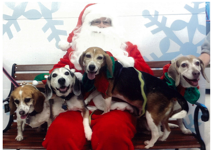
The Harms' four rescue beagles.