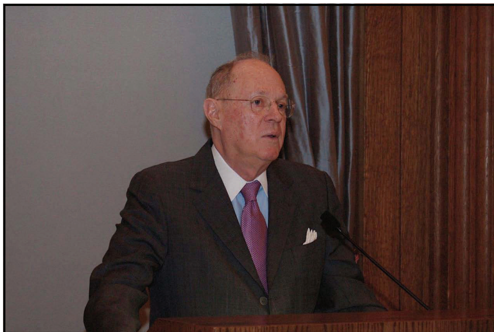
Justice Anthony Kennedy

On May 29, the Capitol Hill Chapter held its annual Supreme Court luncheon in the West Conference Room of the Court, at which Justice Anthony Kennedy spoke. The luncheon was the 38th Supreme Court luncheon hosted by the Chapter.