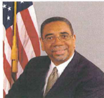
Bobby L. Rush Member of Congress