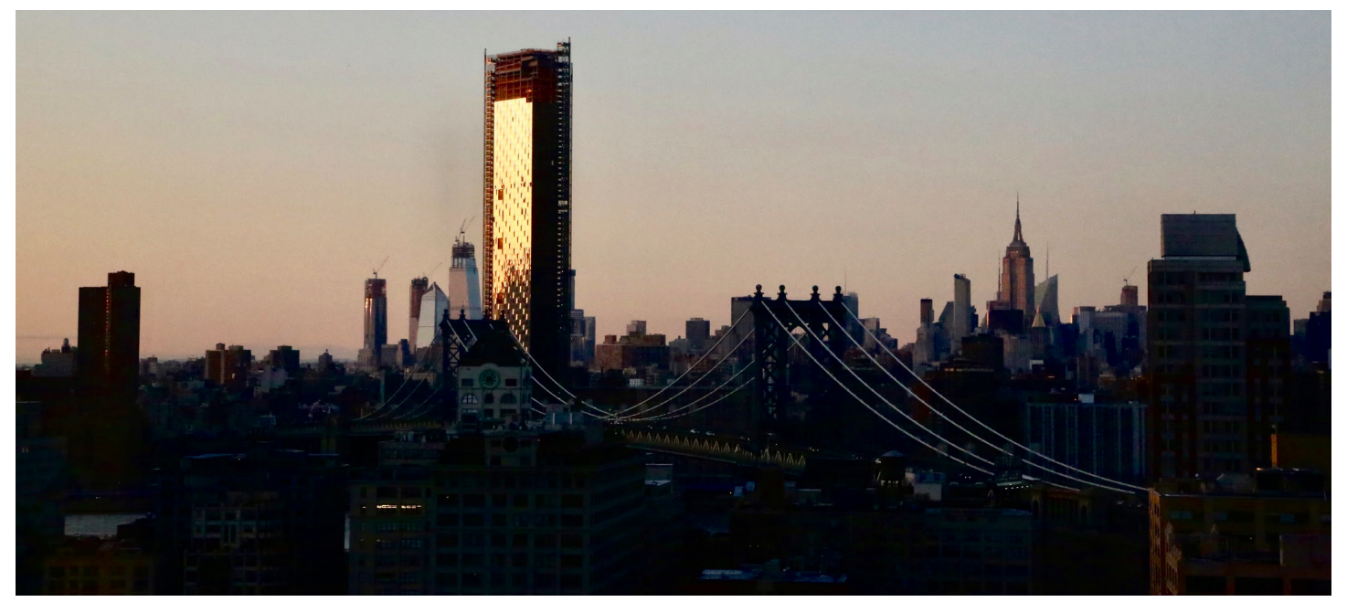
A view of the Brooklyn Bridge from the United States District Court for the Eastern District of New York.