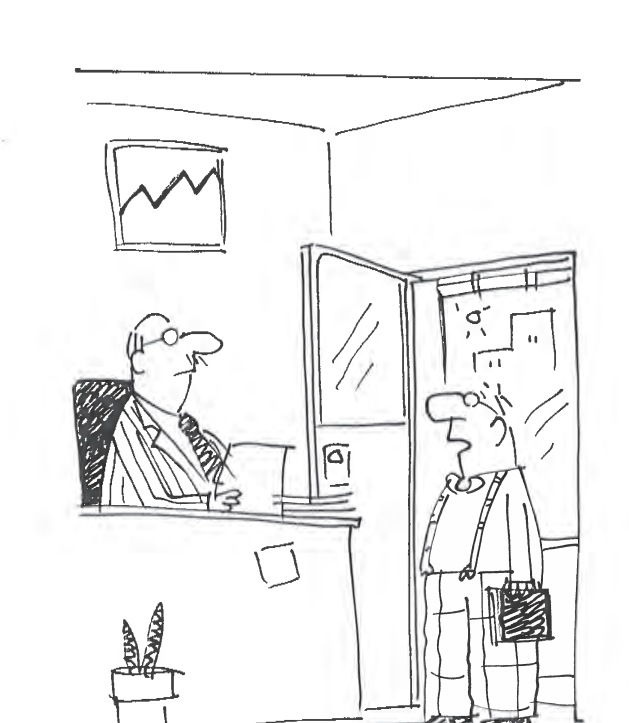
"EARLY RETIREMENT? BUT, BOSS, I CAN'T AFFORD TO RETIRE UNTIL I PAY OFF MY STUDENT LOANS."