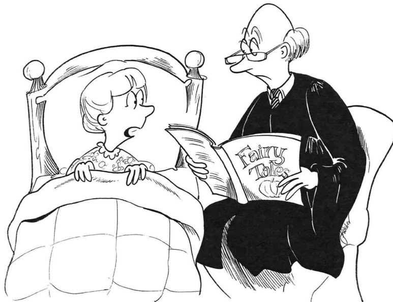
Gram pa...Isn't Peter P. Pumpkin Eater v. Spouse a matter of Reasonable Accommodation and undue hardship?