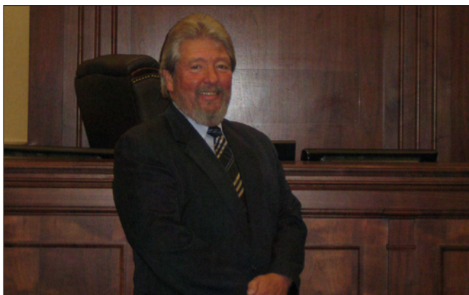
Dayton Chapter: At the Brown Bag Luncheon on April 10—Judge Thomas M. Rose of the U.S. District Court for the Southern District of Ohio stands in his new courtroom.

On March 27, 2013, the FBA Colorado Chapter, in partnership with the University of Denver, Sturm College of Law, held a "Meet the Federal Magistrates" event. The program was well attended and offered CLE credits to its more than 50 participants. Those in attendance ranged from practitioners to law students, and