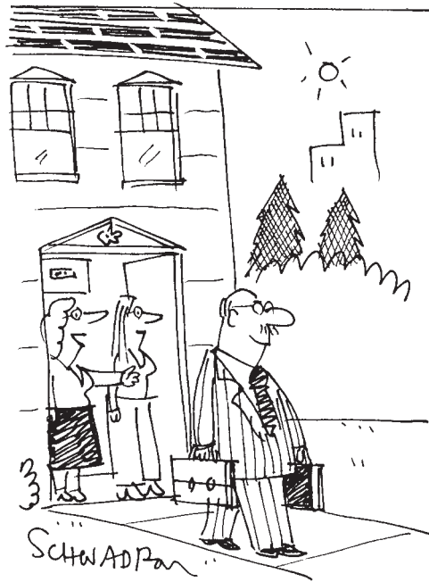
"HE'S AT THE 'AWKWARD STAGE' IN CONVERTING TO PAPERLESS...SO HE CARRIES BOTH A BRIEFCASE AND A LAPTOP."