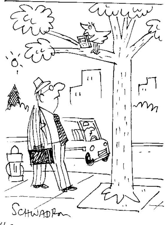
"FOR MY TWEETS, YOU'LL NEED TO GO TO TWITTER. COM."