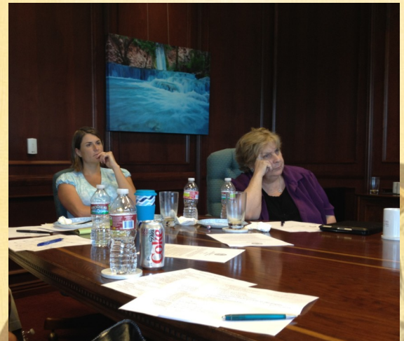
Pictured above and to right: The Executive Committee of the Tucson Chapter of the FBA met on Saturday, July 21, 2012 to plan the upcoming year's events.