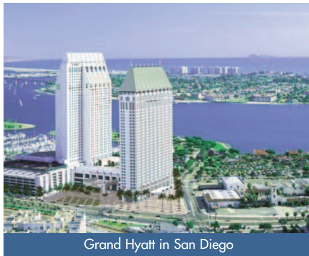
Grand Hyatt in San Diego

Please consider being a part of these events.