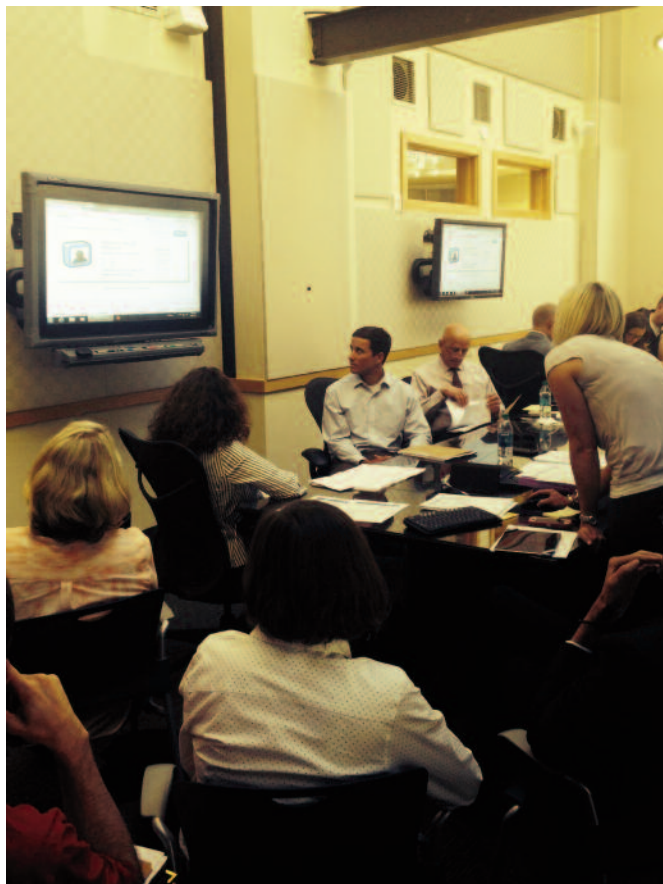
Pro Bono Clemency Night

If anyone is interested in getting involved in this project, please visit www.ClemencyProject2014.org to learn more.