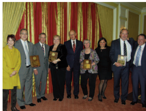
2015 FBA Award Recipients