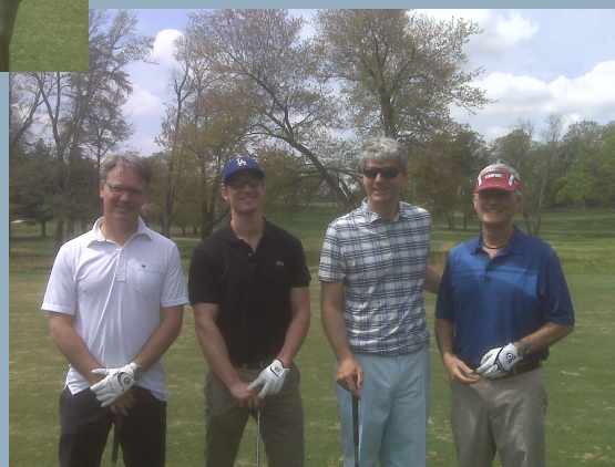
Participants enjoying themselves at the Annual Golf Classic. A good time was had by all.