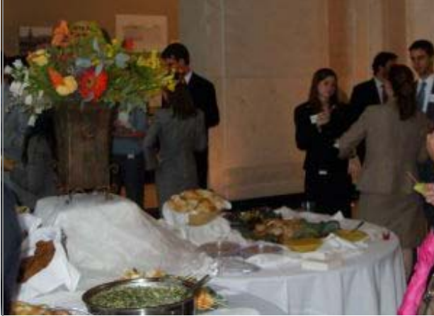
Photos from last year's reception