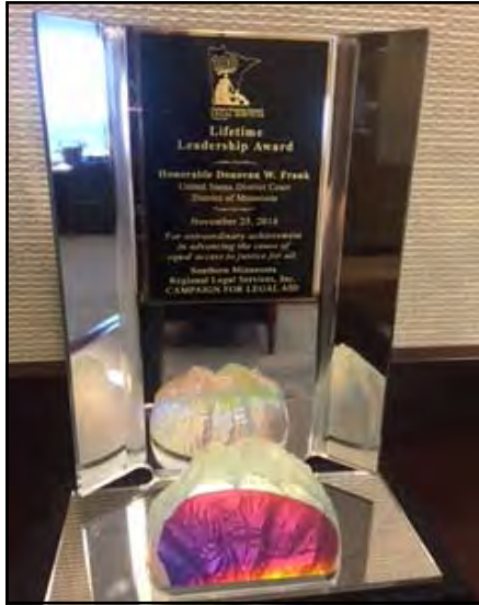
SMRLS's Lifetime Achievement Award.