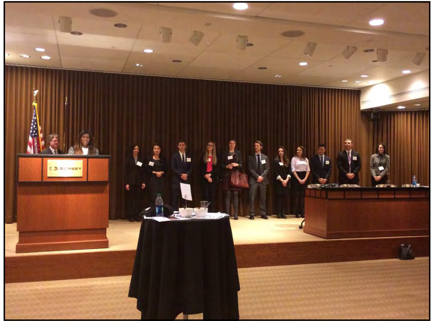
Law school division presidents and members being honored.

With over one hundred attendees spanning across four law schools, the Ninth Annual Federal Bar Association Law Student Reception continued and built upon an impressive history of outreach and engagement with the practitioners of tomorrow. The reception is hosted each year by the FBA and is part of the Law School Outreach Committee's initiative to introduce students to the federal legal community. The reception was held on February 24th at Dorsey & Whitney in Minneapolis. The reception provides a forum for students to network with federal practitioners across a variety of substantive areas and connects them to resources and opportunities provided by the FBA. Whether students are interested in a federal judicial clerkship, immigration law, intellectual property litigation, civil and human rights, or are just curious about the federal bench and bar, all students are welcome and encouraged to attend.