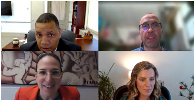
Our esteemed panelists (as mentioned above)