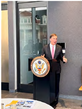
Chief Judge Chagares

Law students and practitioners were welcomed into the Courthouse throughout the day to observe oral arguments regarding a variety of issues before the Honorable Judges of the Third Circuit, followed by the Reception.