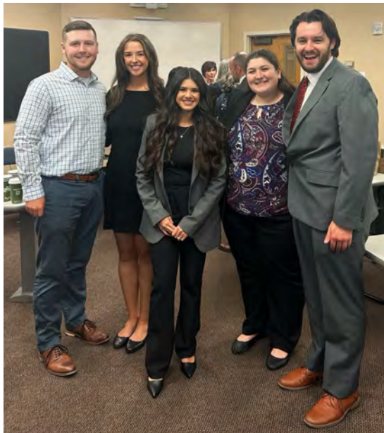
FBA Widener Law School Chapter Members