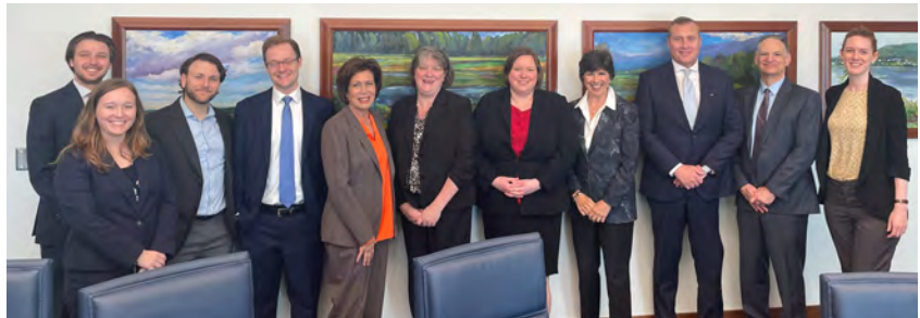
Judge Schwab, Judge Kane, and Judge Bloom among the Brown Bag Lunch Attendees

Discussion was dynamic and lively between the judges and attendees, and topics of conversation ranged all the way from informal and light-hearted to more practice-focused and professional. Attendees asked about the judges' preferences on discovery disputes, the most impactful appearances they have seen in court, and their personal heroes, talents, and favorites.