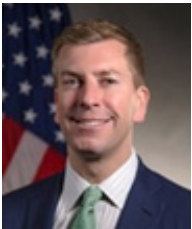
Judge Chad Readler United States Court of Appeals for the Sixth Circuit