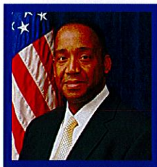
[André Birotte Jr.]