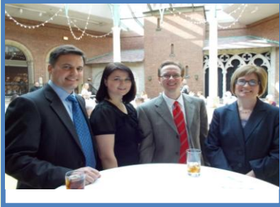
Several Dayton FBA members, and attorneys with the law firm Faruki Ireland & Cox P.L.L., attended the event at the DAI on May 21.