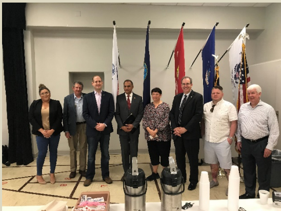
(Left) Members of the Dayton Chapter of the Federal Bar Association who participated in the Wills for Vet event

The Dayton Bar Association and Dayton Chapter of the Federal Bar Association teamed together in honor of Memorial Day at the Dayton Veterans Affairs Medical Center in a "Wills for Veterans" celebration. Wills and related power of attorney documents were written for military veterans and their spouses in an all-day event on Saturday, November 18th. In support of the program, the Dayton Chapter of the FBA presented the Wills for Vets program with a check for the purchase of additional laptops and software, so even more veterans can be served at future events!