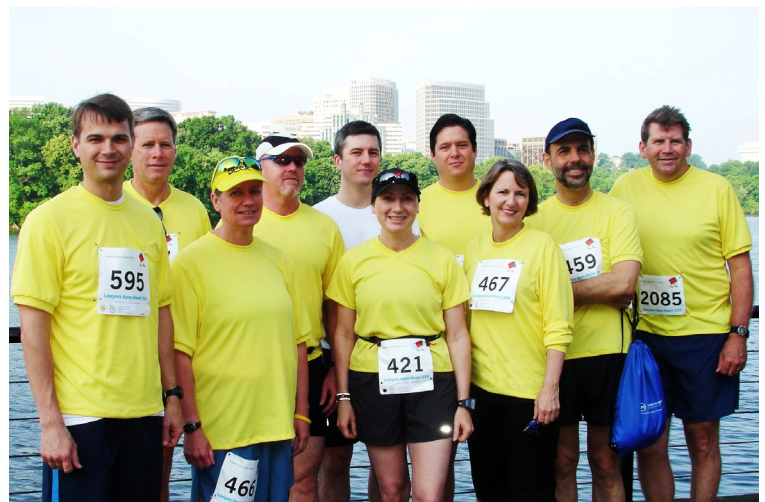
The FBA D.C. Circuit team in post-race mode