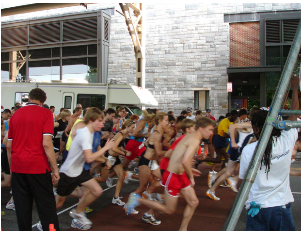
On your mark . . . get set . . . go!