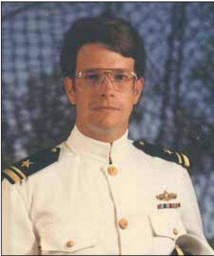
Judge Ashe, circa 1990.