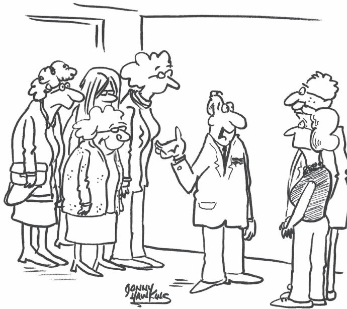
“A mediator hasn’t worked, so I brought in everyone’s mom.”