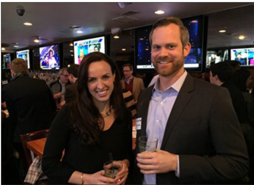
Left: At the February Happy Hour social: Members of the Section on Taxation Young Tax Lawyers Group enjoy the happy hour social.