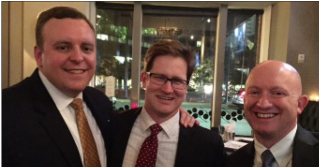
Top: At the February Symposium, panelists led a discussion pertaining to Admiralty Law. Middle: At the February Symposium, panelists prepare for a discussion pertaining to Admiralty Law. Bottom: At the February Symposium, attendees enjoy the networking reception sponsored by Robson Forensic Inc.

2015–16 fiscal year on Feb. 10 with a winter networking event at Penn Quarter Sports Tavern in Washington, D.C. The happy hour brought together a diverse group of tax attorneys from both the public and private sector. The Young Tax Lawyers Group will host a substantive tax panel at PricewaterhouseCooper in April.